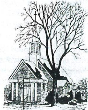
Trinity Chapel 1901 State St. 8:15 a.m.