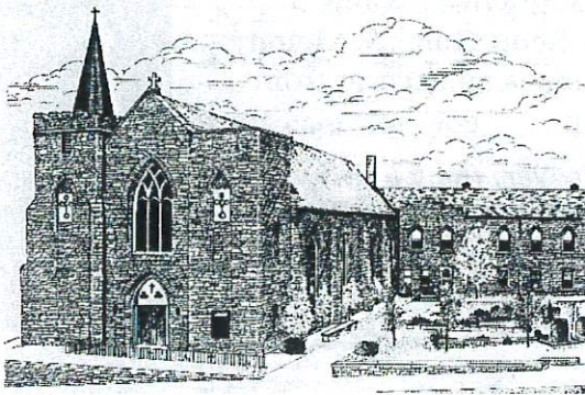
St. Paul's Church 10 E. Third St. 10:30 a.m.