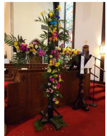
Flowered cross at St Paul's on Easter Day