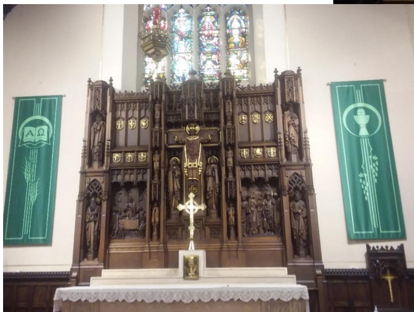
The Cathedral of St. Paul the Apostle, Springfield, IL