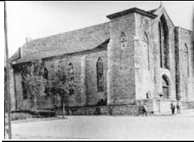
Church After Tornado