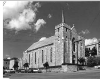
St. Paul's in 60's