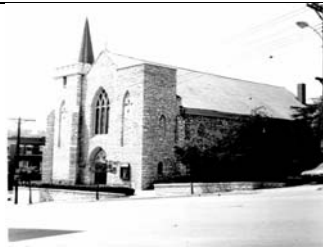
Church Pre-1960 (Right Side)