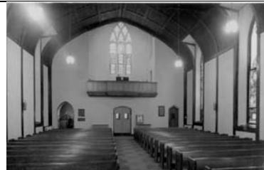
Church Interior-Rear (1945)