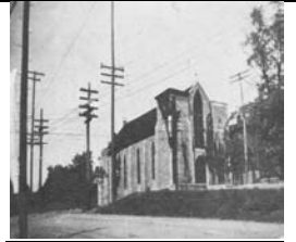
Old Church Pic