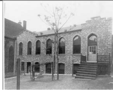
Parish House (Offices)