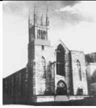
Church with Bell Tower