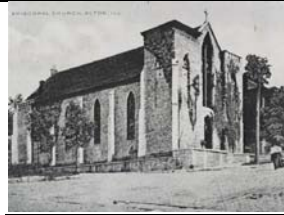
Church No Steeple