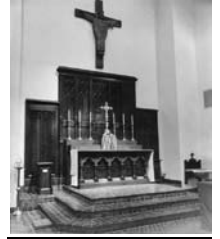
Altar with Sideboards