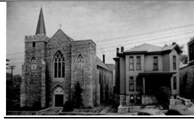
Church and Parish Rectory