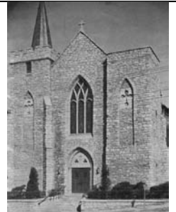
St Paul's (1956)