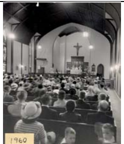
Church Interior 1960