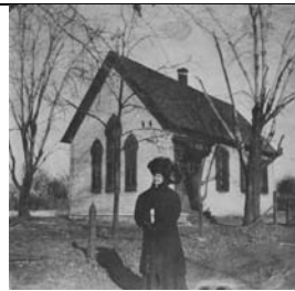
Trinity 1 (Early)