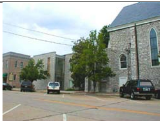
Parish Hall Built 1961